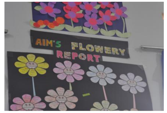
Figure 3 Catterpillar

for the 2nd question, 37 re-sponses for the 3rd question, 45 responses for the 4th question, and 42 responses for the 5th question. Afterwards, the research-er read carefully each response within the groups to identify the keywords used in each response, and the coding was done based on the keyword. After the classifi-cation, the researcher counted the number of the similar coded responses to obtain the percentages.