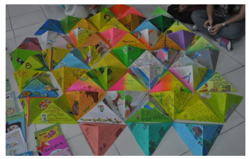
Figure 2 Story Pyramid and Own Developed Storybook

Developing digital story book (group task). In this IT era, it is a must for teachers to integrate technology in the teaching, including English. As one of the target competences of UM English Language Teaching department is IT literate, thus, the researcher assigned the students to write a digital storybook. They could use any software supporting their storywriting, for example power point, and moviemaker. Next, they presented the digital storybook in groups.