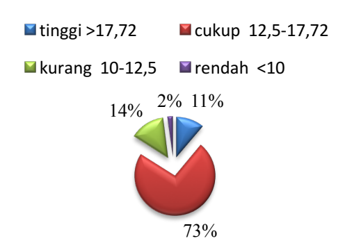
Figure 1. Students' participation category

Based on Figure 1 above, it can be seen that students' participation can be categorized generally into fair category (73%). Next, the high category was 11%, poor category was 14%, and very poor was 2%. Then, students' English learning achievement can be seen in the following figure: